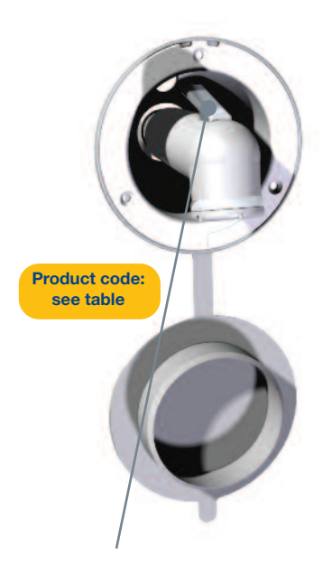
Lightweight handset will not damage the gel coat if dropped on deck

Ideal for installation where space is limited on deck and behind the bulkhead